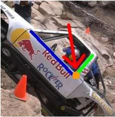
Blue=Doorbar Green=B-pillar Orange=Doorbar Junction to the B-pillar Red=Arrow pointing to the topic of Interest.

http://i37.photobucket.com/albums/e79/Dirtriot/48inch_rule_explanation.jpg